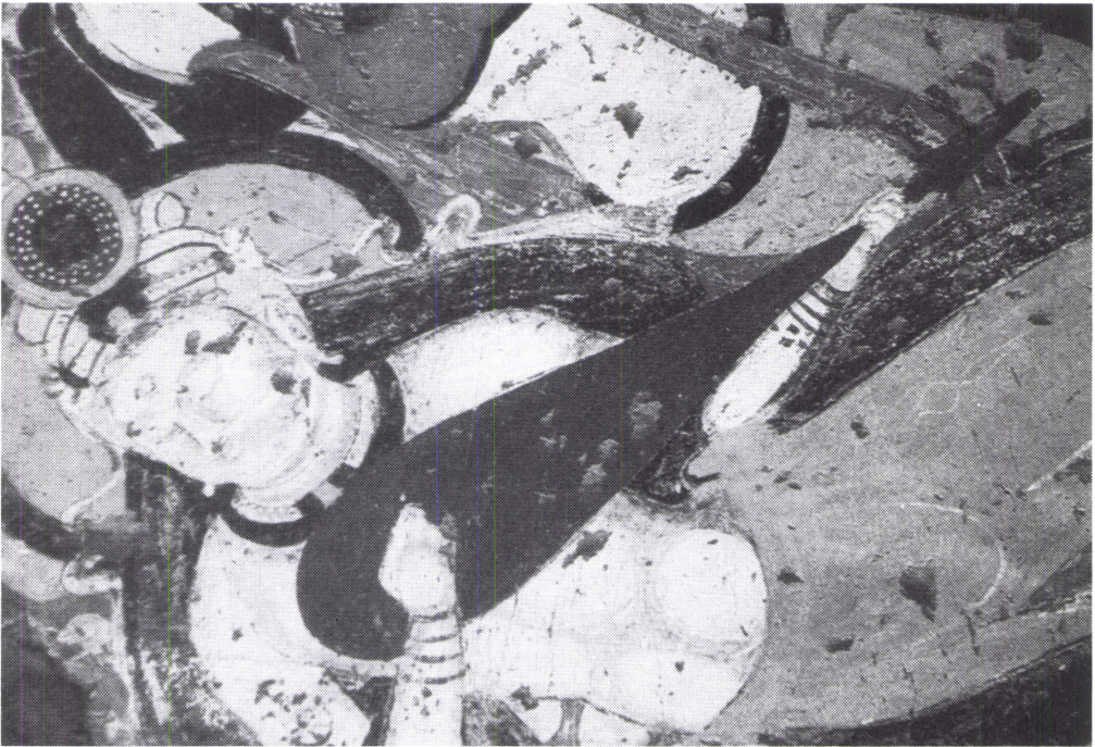
Picture 2. Pipa playing in northern Wei period (386-535). 3

Iconographical research is a new direction of the ethnomusicology. This kind of study is considered to be more important for the Chinese musical research. This is essentially because the resources of the iconography of music in China are very rich. Such iconographical resources contain paintings, whether in books or tombs or caves, and sculptures, which are mostly found in temples and caves. For example, in the Mokao Grottoes of Dunhuang, the location of an important town on the famous "silk road" at the western end of Hexi (west of the Yellow River) corridor in north-west Gansu province, there are 1.600 meters of paintings, many of them concerned with music. Findings from such iconographical resources are significant and beneficial for our study. A picture of a musical instrument, for instance, can give us information on the form of an instrument in a certain period, way of playing, use of the instrument, settings of the performance, and so forth. By comparing the pictures of the same instrument painted in different times, we can find how this instrument had changed in the ancient times. Pipa is a good example shown in the pictures of Dunhuang (see pictures 2 and 3).