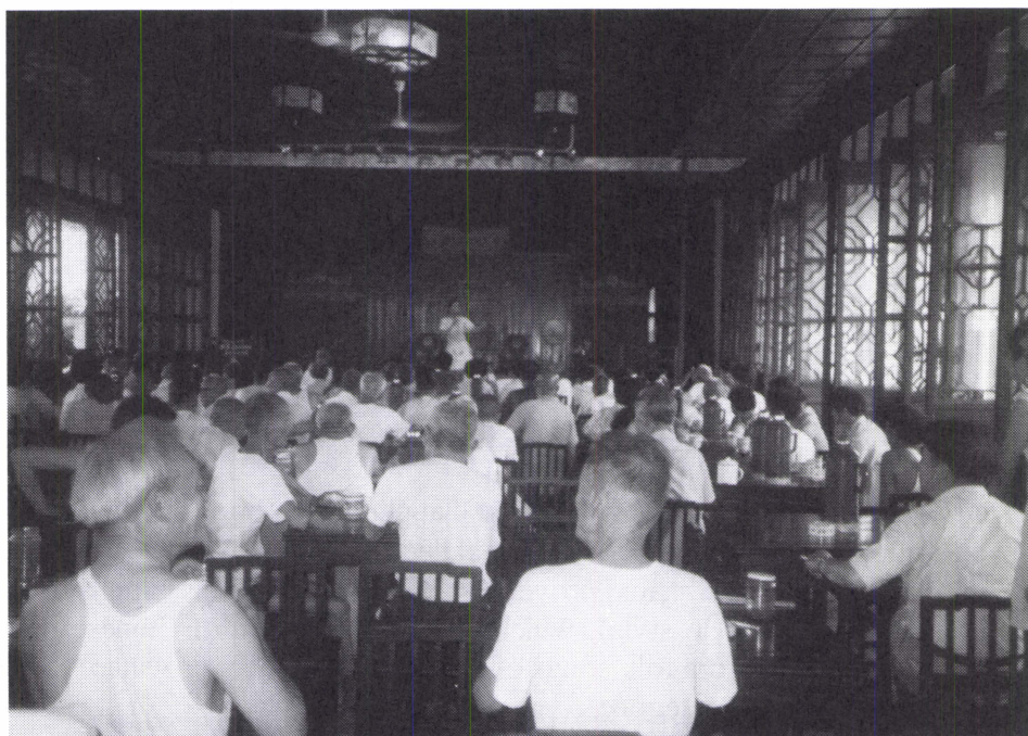
Picture 1. A tea house in Suzhou. Different types of musical performances are always given to the tea drinkers.

It is widely recognised that the content of China's music is richly intertwined with folklore musical traditions widely practised in China. This is inevitable, in view of the many historical events that have shaped the country's cultural evolution to the state that it is today. In this regard, Chinese music research could be considered as being one of the most important branches of ethnomusicology in the world.