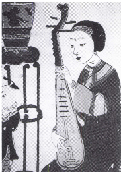
Picture 3. Pipa playing in Qing dynasty (1644-1911).