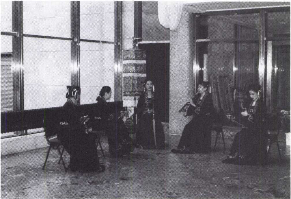
Picture 4. Fujian Nanyin (Southern sound of Fujian province) ensemble from Taiwan giving a performance during the International Conference on Eastern Asian Music, held in Rotterdam, Holland in 1995.

Publications on Chinese music are few in comparison with the boundary of the Chinese musical culture. (Kouwenhoven, 1990, a.) But this does not mean that the Chinese study of music were without merits. Both Chinese and Western scholars have already conducted fruitful research into Chinese music.